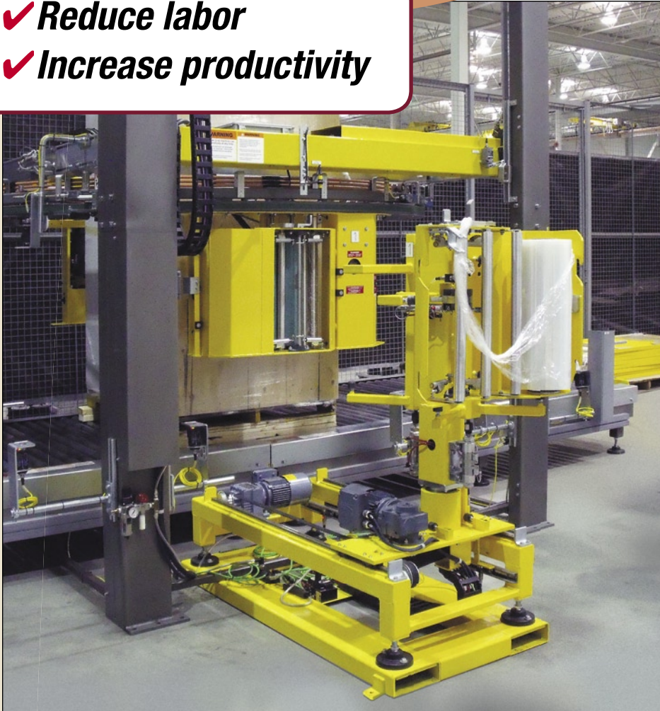
Additional space required (including safety fence): 78" W x 43" L x 63" H