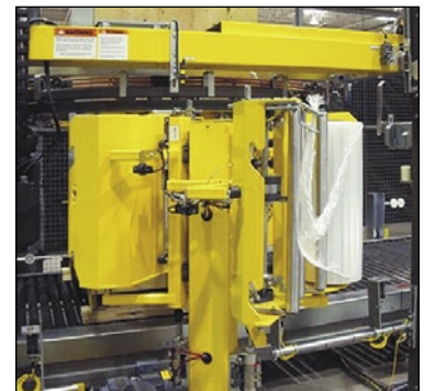
Auto Roll Changer enters wrap zone, removes depleted film and rotates new film into position.